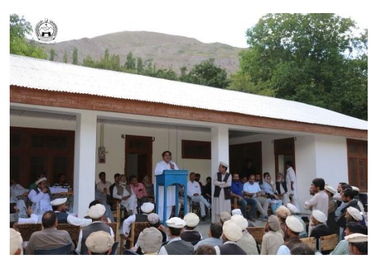
Exposure visit to GLOF-I Project site - Bindogol

Line Departments and Stakeholders exposure and learning visit to GLOF-I project site in Chitral was carried out on 1st July 2019; all stakeholders were briefed by local community members about the GLOF-I project activities, challenges, successes and lessons learnt. The officials were requested to keep the previous valleys involved in the GLOF-II Project activities.