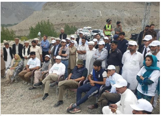
Presentation by local community at Passu village, Passu

This was followed by a presentation from the Passu village regarding past GLOF event and its impact on the community's cultivation land. The community briefed the Advisor on the Past GLOF event and brought his attention to