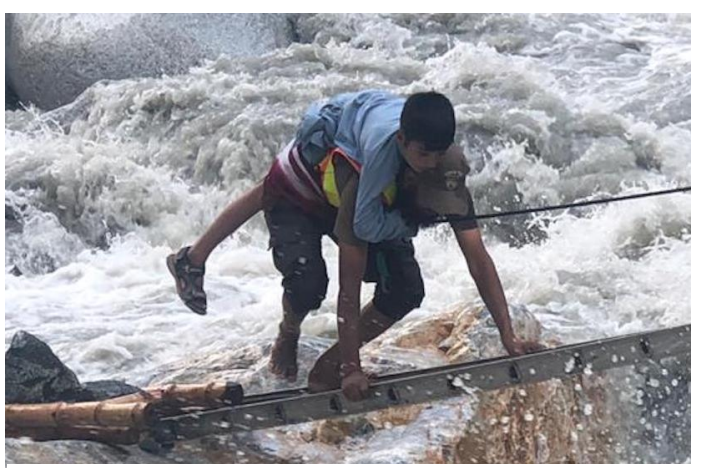
Rescuing the local community in GolainGol valley, Chitral

Department (PMD) to initiate community mobilization, formation of Community Based Disaster Management Committees (CBDRM Committees) and identification of feasible sites for flood protection structures, slope stabilization and irrigation infrastructures. PMD constituted team are implementing planned activities, including ground-truthing along with representatives of line department. Team is in the process of assessing Potential GLOF valleys (as approved in Pro-Doc and PARC/PMD Report of 2016).