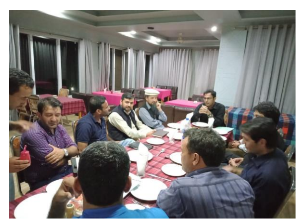
Meeting will Local Communities at Ghulkin, GB