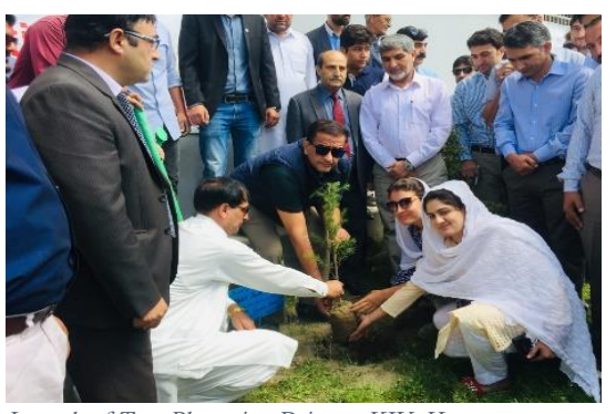
Launch of Tree Plantation Drive at KIU, Hunza

Local students of Nalter Bala participated in the cleaning campaign at Naltar Lake. Advisor strongly condemned the human infrastructures built around this unique ecosystem and asked immediate action to be taken to conserve it.