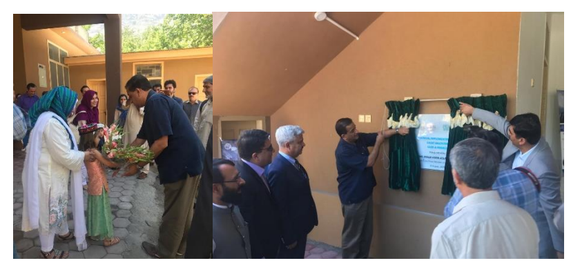
Deputy GLOF II Project office Launch, Gilgit

On 23<sup>rd</sup> August 2019, Advisor Prime Minister to inaugurated the GLOF II project office in Gilgit accompanied by Chief Secretary GB, Additional Chief Secretary Development GB, Secretary Home, Secretary Forest and Wildlife GB. Commissioner Gilait Division,