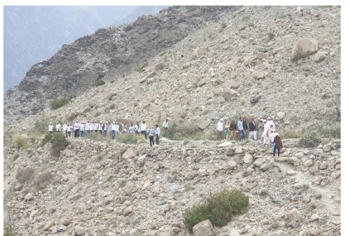
3<sup>rd</sup> activity was at Borith Zero point where 60 Tree Plantation Drive at Hussaini youths (Male/Female)