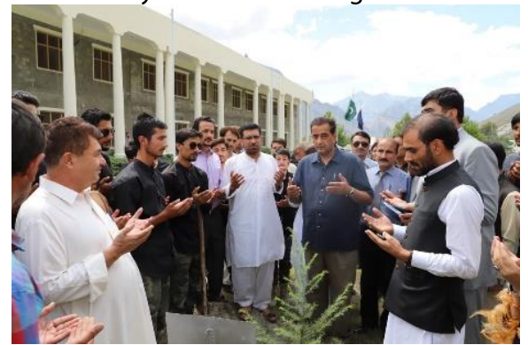
Launch of Tree Plantation Drive at KIU, Gilgit

Government for full support from the Federal Government in all the projects initiated by the Ministry of Climate Change.