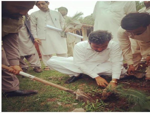
Plantation Activity, Upper Chitral

Community sensitization and awareness sessions were conducted on 30<sup>th</sup> August 2019 in Shringal Valley;1000 trees were planted by students and community members in Shringal and Kumrat Valley. Plantation activity and awareness session were also organized in the community of Reshun Valley in Upper Chitral on Monsoon Plantation day where 250 plants were provided by forest department. School Children, women and community