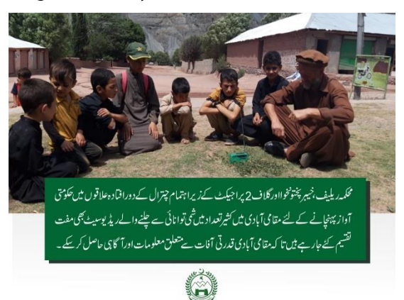
عكى رىلىف بحال دا آبادكارى، خير پيخونوا Radio distribution by KP DMA and GLOF II, Chitral