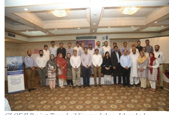
GLOF II Project Team building workshop, Islamabad