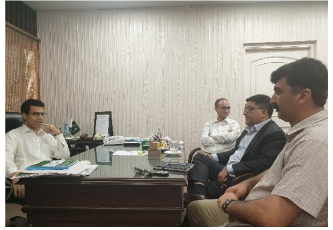
Meeting with Chief Economist KP, Peshawar