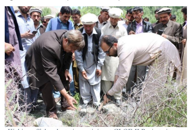
Kicking off the plantation activity at GLOF-II Project site

GLOF-II project team. Secretary RRS including Line Department Representative were briefed by the local community members about the GLOF events, disasters and vulnerabilities related to local community members and their expectations from GLOF-II Project. Community members also voluntarily initiated plantation in the Arkari valley, Chitral with support of GLOF-II Project and planted 1000 plants provided by Forest Department of KP in one day by mobilizing students, women and community members.