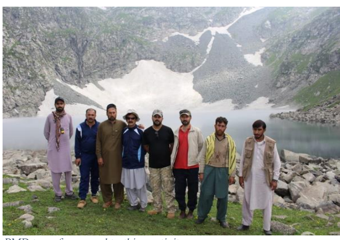
PMD team for ground truthing activity

Nomination of focal persons from Line Departments of KP for ground truthing activities of potential GLOF-II sites was done in close coordination with Pakistan Meteorology